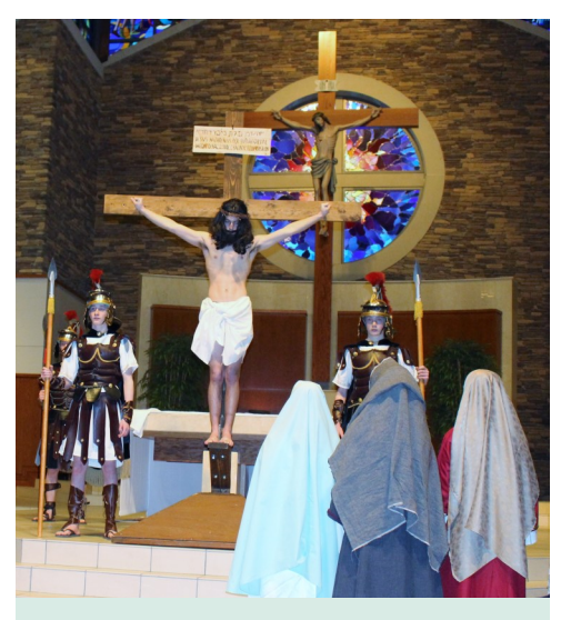
Enacting the living stations of the cross in costume during Lent is a tradition for our eighth grade parish school children.

By the early 18th century, the Order of Friars Minor (the Franciscans) erected 14 shrines in their churches to evoke the feeling of being on the journey to Calvary along with Je-