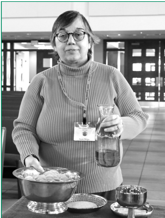
Saint Elizabeth is blessed to have both daily and weekend sacristans. This ministry is open to any parishioner age 16 or older.